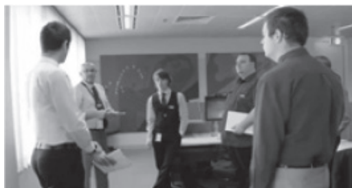
Morning Scrum, Adelaide